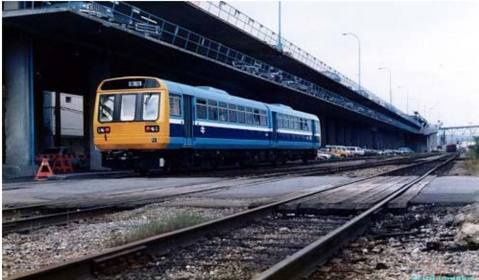
British Railbus at New Westminster Quay set for Abbotsford

British Railbus ran passenger rail service from New Westminster Quay to Abbotsford on the old BC Electric tracks for $12.00 return during Expo 86. Railbus ridership was so heavy that the BC Government halted service part way through Expo 86 to stop the public - voters from demanding the government reactivate passenger "Rail for the Valley" service.