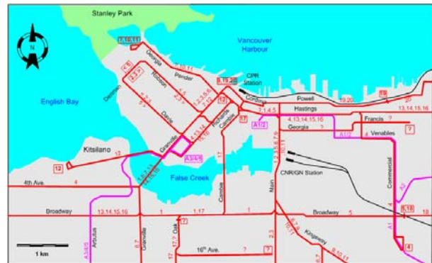
1940 Streetcar - Interurban Maps

http://www.tundria.com/trams/CAN/Vancouver-1940.shtml