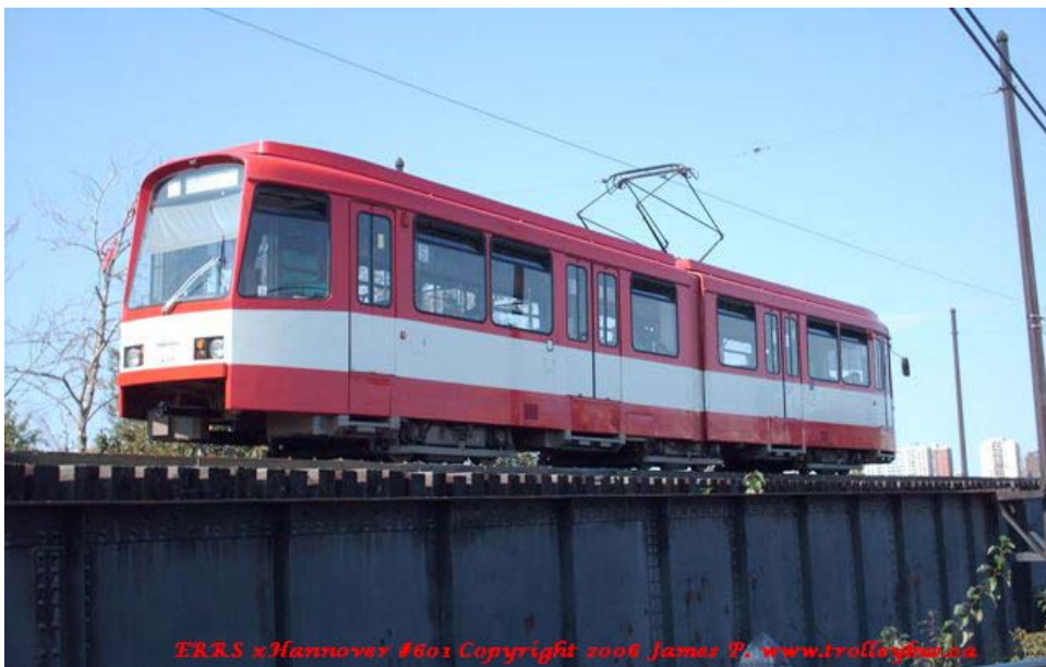
2006: Vancouver Streetcar #601 runs in Edmonton. www.trolleybus.ca/errs/601.htm

1987 Siemens 1970 Streetcar #601 sold to Edmonton for $1.00 (cost $150,000.00 ). Siemens installed new 4" wide wheels to run on Edmonton heavy rail tracks.