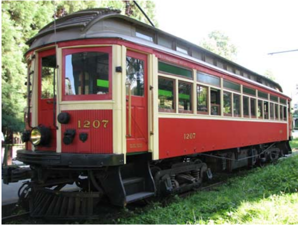
1905 BC Electric Tram #1207