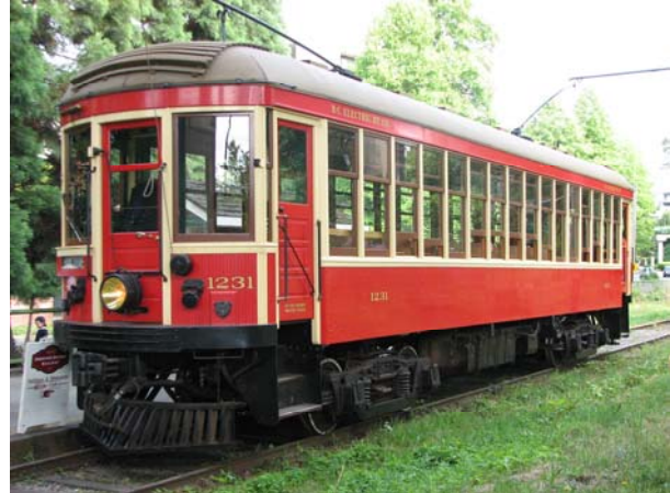
1912 BC Electric Tram #1231